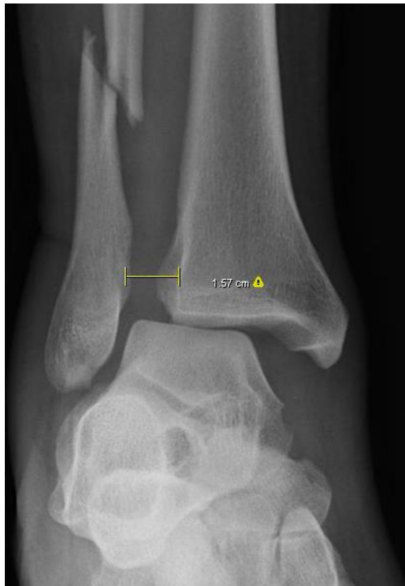
Fig. 1 Preoperative measurement of tibiofibular diastasis indicating syndesmosis disruption.

Between September, 2006 and October, 2011, 21 adult patients with external rotation type injuries and intra-operative confirmation of disruption of the distal tibiofibular syndesmosis were retrospectively reviewed. Included in this study was any closed, unstable, trimalleolar, bimalleolar, lateral malleolar, or Maisonnueve fracture undergoing ORIF by one surgeon (Fig. 1).