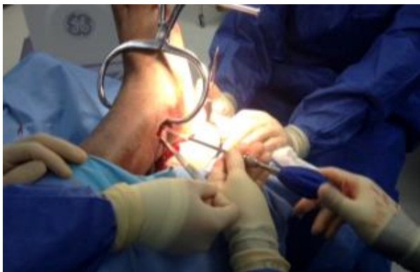
Fig. 5 Application of syndesmotoc clamp for reduction prior to screw insertion.

After reduction of the fracture patterns, the syndesmosis was stressed with an external rotation force under live fluoroscopy. The syndesmosis was reduced using a large pelvic reduction clamp in both groups (Fig. 5). Either bioabsorbable or metallic screws were placed across the syndesmosis while purchasing 4 cortices using standard AO and manufacturer technique.