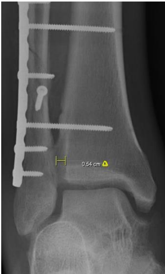
Fig.4 Tibiofibular clear space measure after metallic screw fixation.

After reduction of the fracture patterns, the syndesmosis was stressed with an external rotation force under live fluoroscopy. The syndesmosis was reduced using a large pelvic reduction clamp in both groups (Fig. 5). Either bioabsorbable or metallic screws were placed across the syndesmosis while purchasing 4 cortices using standard AO and manufacturer technique.