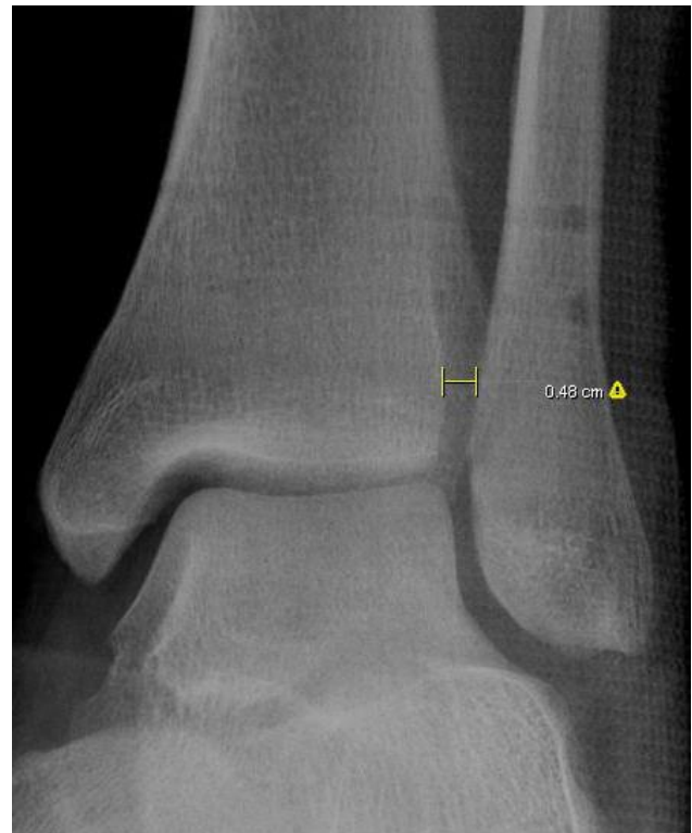
Fig.3 Tibiofibular clear space measurement after bioabsorbable screw fixation. Average radiographic follow 6.15 months for bioabsorbable screw fixation.

Clinical and radiographic follow-up was performed. Radiographic assessment included measurement of tibiofibular clear space 1 cm above tibial plafond on mortise view (Fig. 3,4). Patients requiring subsequent procedures for transsyndesmosis implant removal were also recorded.