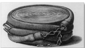
Figure 3. "Langenbeck" bandage [1]

Johann T. Friederich August von Esmarch is given credit for winding tensile material around a limb in order to express venous blood in combination with tourniquet. He was disturbed at the amount of blood still present in an amputated limb. However, he gave credit elsewhere for the bandage. The "Esmarch bandage" used today was actually designed by von Langenbeck who loosely based the bandage off previous designs by Esmarch. This elastic bandage is correctly termed "Langenbeck bandage."