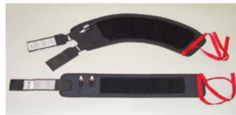
Figure 6: Contoured Cuffs [10]

safety margin of 40 mm Hg for LOP of <130 mm Hg, 60 mm Hg for LOP of 131-190 mm Hg, and 80 mm Hg for LOP of >190 mm Hg. Another way of determining limb occlusion pressure, compared to doppler, is via Graham's formula. This equation incorporates limb circumference, cuff width, and systolic and diastolic blood pressures. On a 2005 survey of foot and ankle surgeons, the vast majority based the cuff pressure exclusively on the limb size and systolic blood pressure [7].