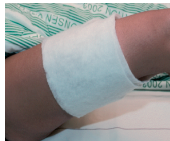
Figure 5: Limb Protection [6]

Limb protection before tourniquet application is common practice to prevent skin injury. Olivecrona et al in 2006 determined that an elastic stockinette under a pneumatic tourniquet cuff protected against the development of blisters during total knee arthroplasty better than cast padding or no padding [6]. The study consisted of ninety-two patients split into three groups: elastic stockinette, cast padding, no padding; blisters developed in zero, three, and seven patients, respectively. However, the study was limited in that they used contoured cuffs and straight cuffs at anesthesia discretion with 70-100mm Hg in contoured and 100-150 in straight cuffs. The duration was also longer in the group that developed blisters but not statistically significant.