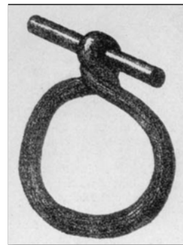
Figure 1. Morell-type Tourniquet [1]

mainly controlled venous bleeding rather than the sought after arterial hemostasis. There were little significant improvements over the course of the next 1500 years until Morell in 1674 used a stick to twist a constricting bandage [1].